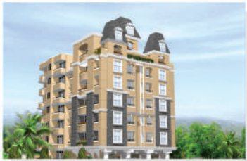
Le Grand Designs Collection in Architecture