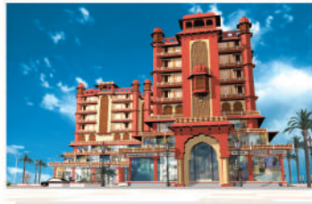
|| SUN n MOON ||