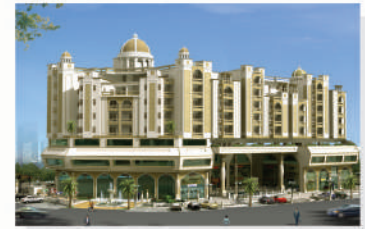
BELVEDERE PARK Redefining Lifestyle